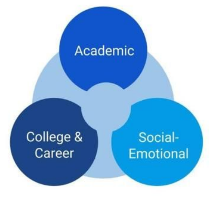
Three Domains of School Counseling